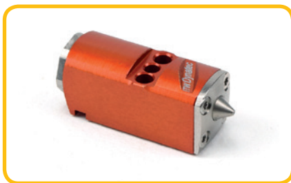
Mini module ITW Micro 10