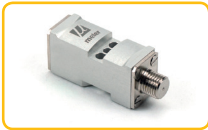
Mini module Meler

Below you'll find an overview of the various mini hotmelt modules that BIT Hotmelt Technology can provide.