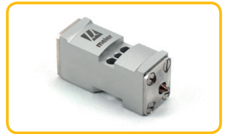
Mini module Meler ZC, fixed nozzle