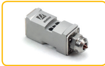
Mini module Meler ZC, removable nozzle